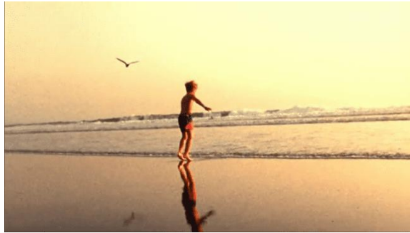
Image 5. Derek's memory of childhood near the sea. (01:42:50)

As a changed man, Derek got a new life with a new way of life. After Derek gets out of prison, there is a flashback scene of a childhood memory of Derek playing near the sea. In a flashback scene of Derek's childhood, taken in a long shot with low camera angle, with mainly sepia color scheme. The longshot is used to establish show the point-of-view of a child who is quite active and unsteady, adding the low camera angle, and the use of the sepia color scheme cement this scene to be one of Derek's childhood memories.