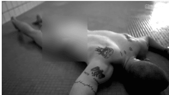
Image 6. The aftermath of the rape (01:26:12). Notice the Nazi tattoos and DOC tattoo on shoulder.

In the aftermath of the rape, Derek is left alone naked, unconscious, and bleeding in the bathroom with water still flowing from the shower stall.