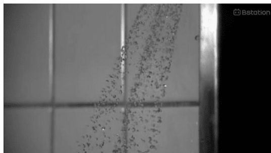
Image 4. An insert showing running water from the shower stall (01:25:47)