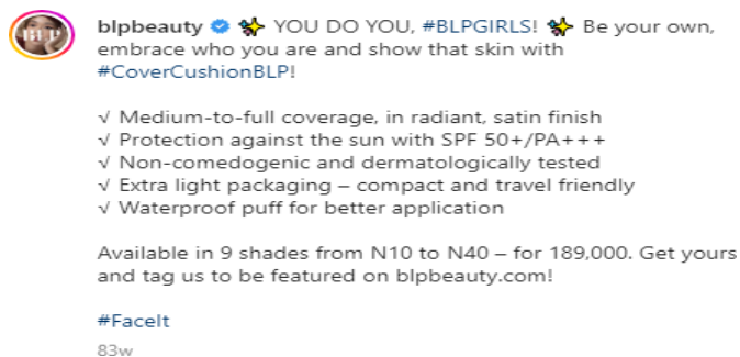
Figure 1. Textual Structure (3.A.1)

The caption is a description that tells an image in a post on social media. Here's an example of a caption on a blpbeauty Instagram post: