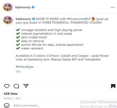
Figure 2.1. Activity and Topic (4.A.3)

Figures 2 and 2.1 above are two different types of activities according to postal descriptions. Figure 2 explains blpbeauty's opinion about the superpowers that women have. This represents blpbeauty's activities in providing motivation to women who read blpbeauty's Instagram captions. Then in Figure 2.1, you can see a description of blpbeauty which explains the advantages of "Power Liner BLP" which is one of blpbeauty's products. This refers to blpbeauty's activities in providing product information to all readers of the blpbeauty Instagram post caption.