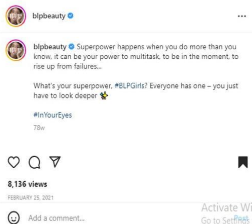
Figure 2. Activity and Purpose (4.A.2)