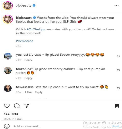
Figure 4. Effect Situational (6.C.1)

At this situational level, discourse is found in normative relationships between participants and MR (resource members) where the situation is not a problem for the participants. In previous analysis has proven that blpbeauty Instagram captions create social reactions and social discourse in public thinking. There are example of a social reaction image contained in a post comment on the blpbeauty Instagram account: